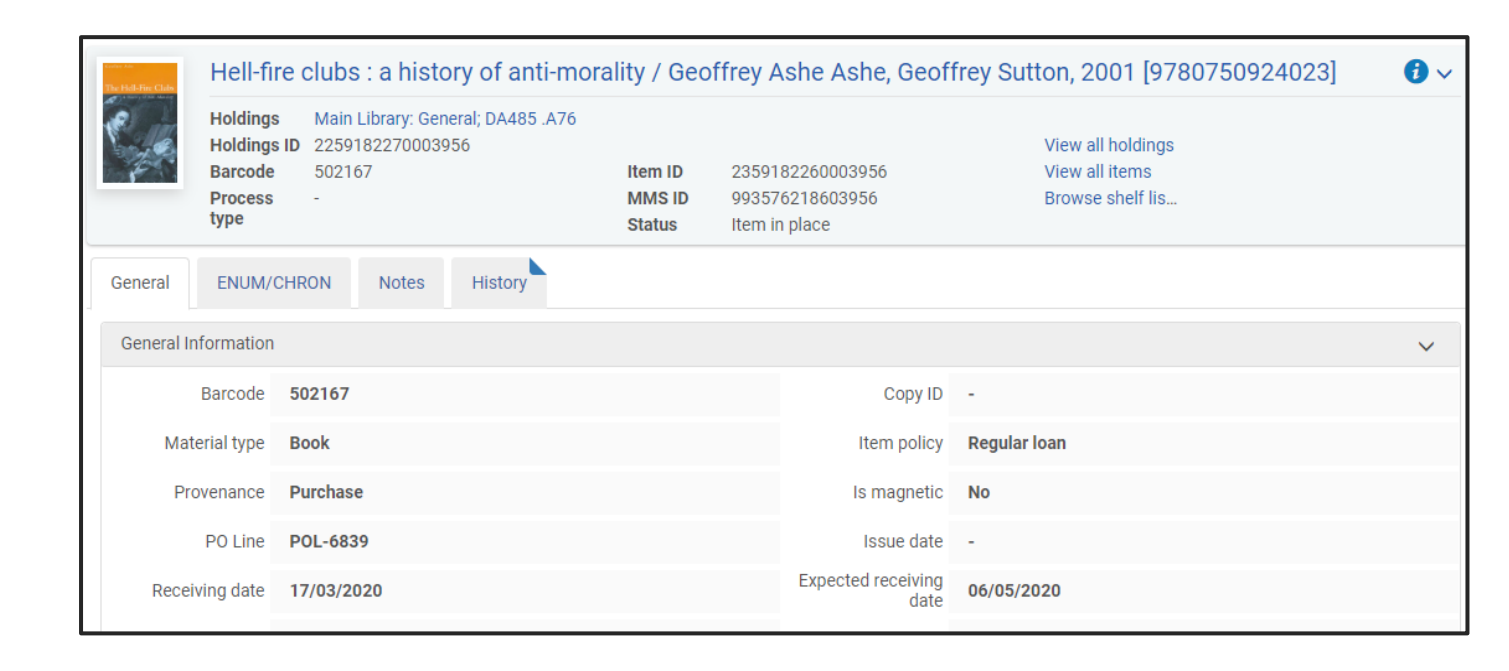
Appendix 3: ALMA Items Record