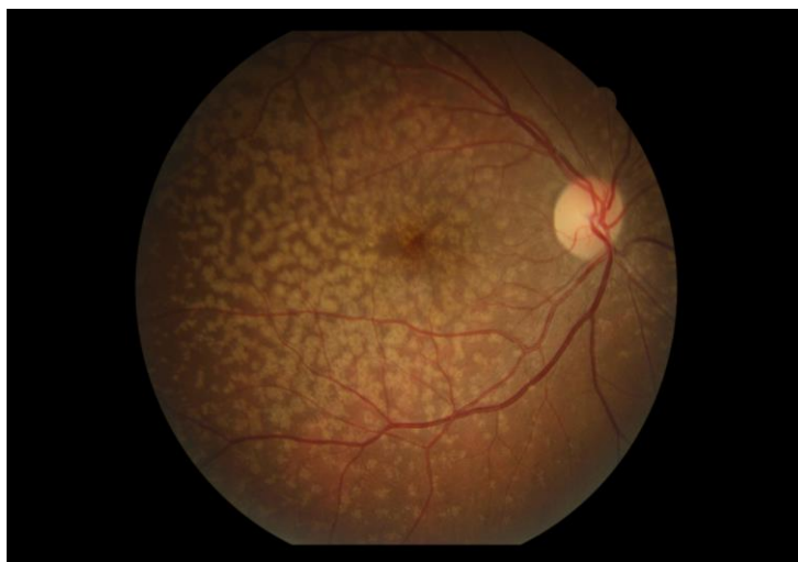
Figure 1: Fleck retina, right eye