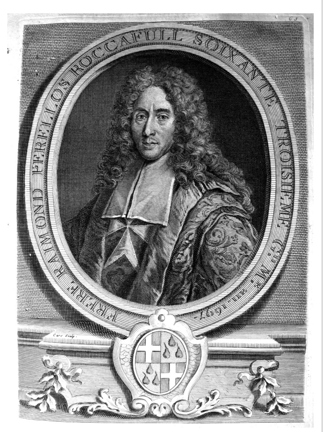
Figure 3: Legend Portrait of Grandmaster Raimond Perellos

Capello describes the manoeuvres by which Perellos secured the grand-mastership. He had a miserable income and depended on a (Maltese?) merchant for maintenance. In order to buy votes he embezzled 30,000 scudi from the fund for the redemption of slaves. Had his bid to become Grand Master failed, he would have been ruined as he was in no position to return the ill-gotten bribe money. He exercised no authority at all over knights of the Grand Cross, who laughed at him behind his back, nor on the population, as anyone who wanted to escape his jurisdiction just became a cleric of the bishop or a patentee of the Inquisitor. That simple.